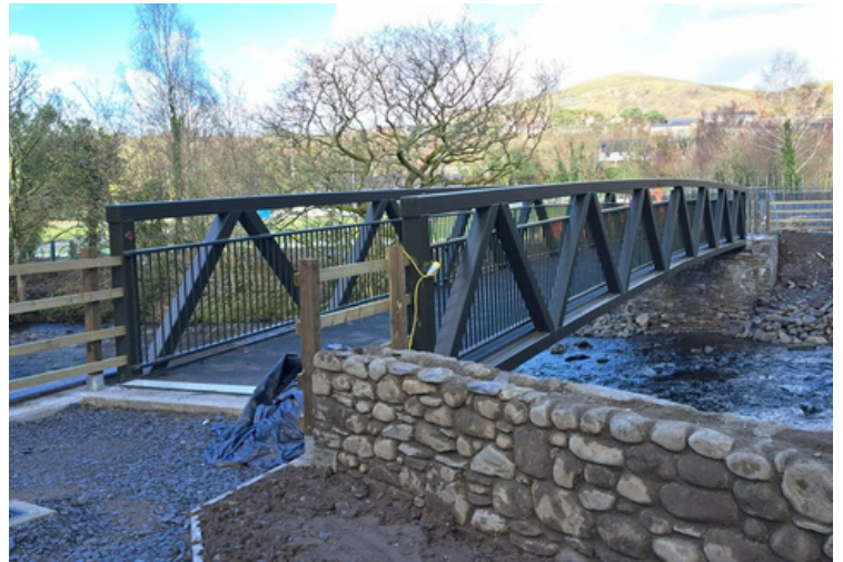
Pont Sarnau, Dyffryn Ogwen