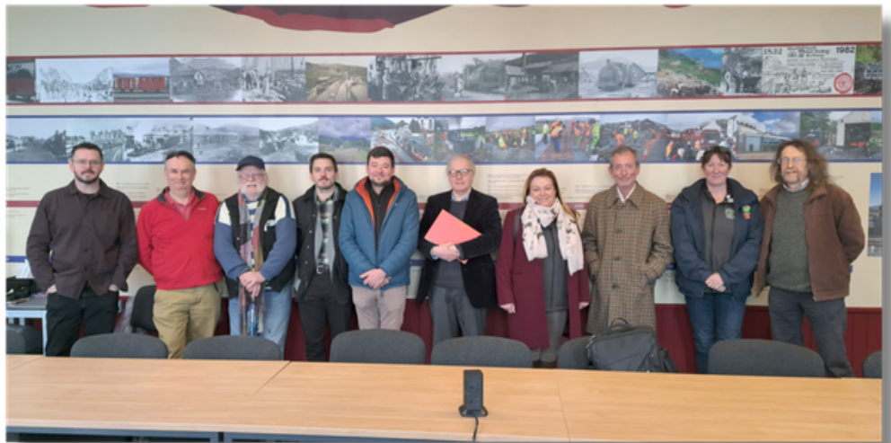
WHS Benefitting group, Boston Lodge

Amgueddfa Lechi staff visited our conservation project at Hen Ysbyty Chwarel Y Penrhyn (Dyffryn Ogwen) for a guided tour . The project forms part of the wider UK Government-funded Llewrych o'r Llechi regeneration programme, which is also contributing to the redevelopment of Amgueddfa Lechi.