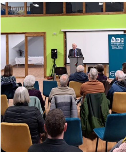
Lecture, Dafydd Wigley

The most recent meeting of our 'Benefitting from the WHS' subgroup was held in person, at Boston Lodge, hosted by Ffestiniog and Welsh Highland Railways. During a guided tour after the meeting, attendees learnt about the recent National Heritage Lottery Fund project, which has revitalised and safeguarded buildings at the site.