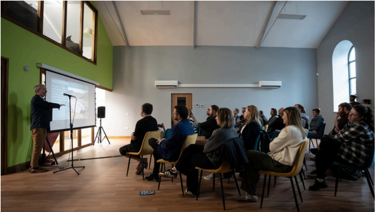
Yr Aelwyd, Blaenau Ffestiniog

The Llechwedd Path has already been completed. Recently, Gwynedd Ymgynghoriaeth Consultancy (YGC) won the CIHT Cymru Wales 2025 Active Travel Award for the scheme.