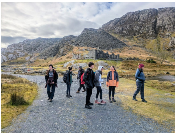
Young Slate Ambassadors

The Young Slate Ambassadors programme has begun, working in partnership with Yr Urdd Outdoor Service. Young people aged 13–16 will have the opportunity to come together each month to explore the slate landscape, learn about our heritage and develop a wide variety of skills. In February, the group spent a stunningly sunny Saturday in Cwmorthin with Heneb, learning about the area's history.