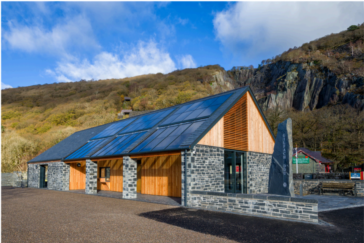
Welcome block, Parc Padarn

Improvements at Parc Padarn are progressing, with the first phase of upgrades to the car park now complete, along with the opening of the new welcome block and the completion of conservation work on the A1 Incline and winding house. Contractors have been appointed to undertake conservation work on the Hafod Owen building, upgrade work on the Fire Queen shed will begin soon.