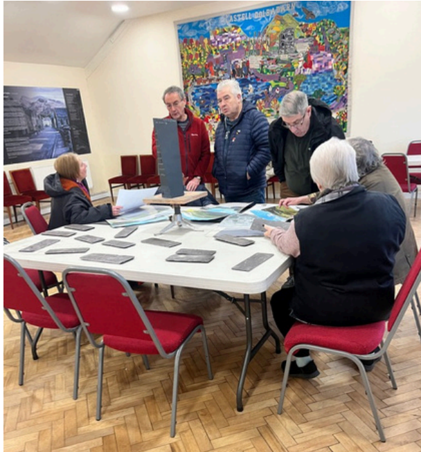
Community session, Llanberis

Improvements to Pont Cae'r Ddol in Llanberis are now complete.