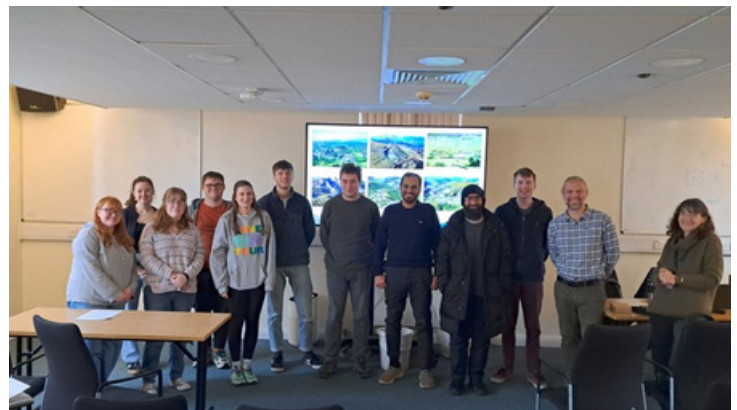
Lecture, Bangor University

In January, the first meeting of our informal ' Caban Dehongli ' group took place. This is a monthly opportunity to come together for an hour to discuss interpretation matters. Different partners lead the discussion, focusing on a different topic each time. The aim of these sessions is to share knowledge and resources, offer advice and good practice and to collaborate.