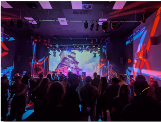
Un Pnawn Tywyll, Neuadd Ogwen

Upgrades to Lôn Las Ogwen are also progressing, with the cattle underpass now completed and gates removed from the path in order to enhance accessibility. The new Pont Sarnau bridge has been installed, this will be opened to the public once nearby footpath improvements are complete.