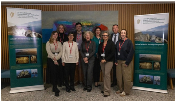
Conference, Dublin.

Each year Llechi Cymru and Cadw staff contribute to Bangor University's Global Heritage MA course, discussing how The Slate Landscape of Northwest Wales World Heritage Site is managed.